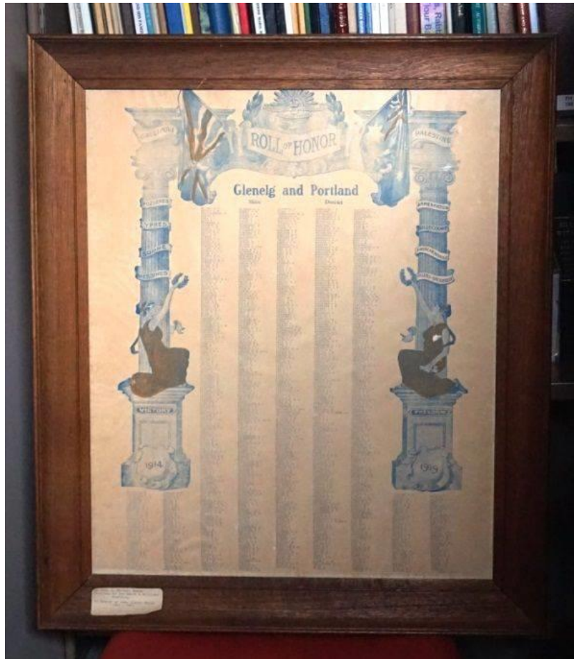
Glenelg Shire & Portland District Roll of Honour