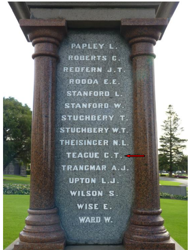
Portland War Memorial